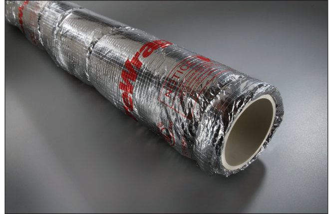
FyreWrap 0.5 Plenum Insulation